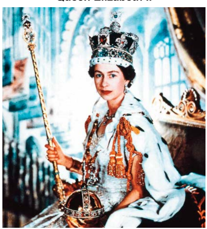
R.I.P, and thank you for a lifetime's devotion to our country.